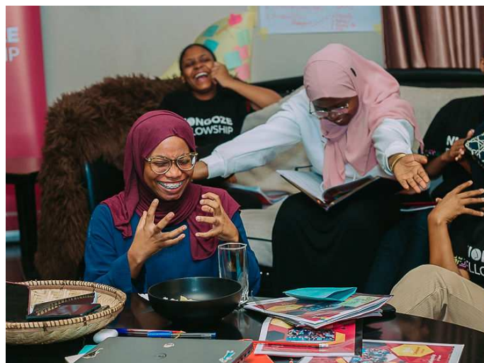
Niongoze Fellows during one of the training sessions.

Each of the Niongoze fellows wrote a powerful and touching statement that showed their personality, mixed with the passion for work they are just now starting.